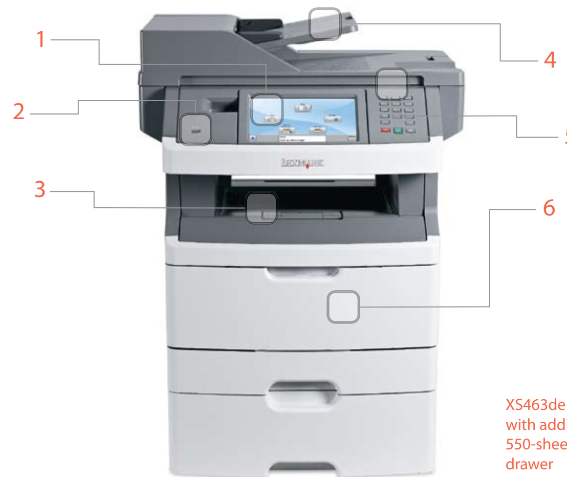
XS463de with additional 550-sheet drawer

Quickly and easily scan and archive documents in a wide variety of file formats including: TIFF, MTIFF, JPG, PDF, Secure PDF and XPS.