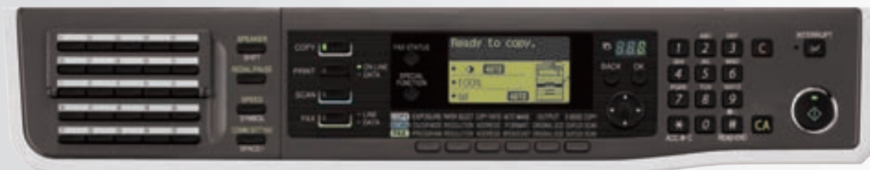
MX-M200D Control Panel with optional Fax Kit.

Maximize capabilities of your MX-M200D with optional full-color network scanning and feature rich network printing! With simple plug-and-play operation, the optional full-featured Network Expansion Kit offers PCL6 network printing, walk-up scanning, web-based device management and more. With Sharp's easy-to-use utilities and driver software, the versatile MX-M200D can easily integrate into an existing network environment.