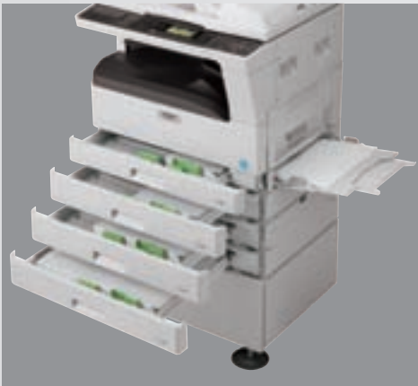
MX-M200D shown with optional 2 x 500-sheet paper feed unit.