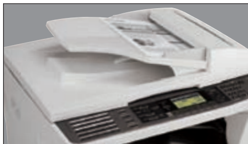
MX-M200D shown with standard 40-sheet Reversing Single Pass Feeder.